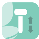
Height adjustable arm