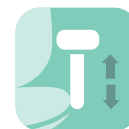
Height adjustable arm