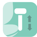
Height adjustable arm