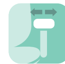
Adjustable arm pad width