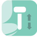
Height adjustable arm